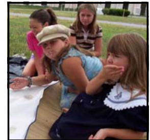
July BGMC: kids eat rice on our pretend missions trip