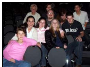
Youth Convention in Columbus