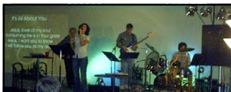
Saturday Night Worship Celebration

Thank you to those who sent congratulatory e-mails, flowers and cards! We appreciate your continued support.