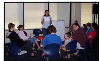
August: Family Spiritual Night