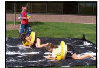
August: A lesson on water baptism along with fun water games