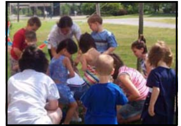
July 4th: Kids dive for candy