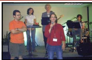
A member shares what God has done in the last year.

"Ramping Up at Rockside" was the sermon series in August leading up to our First Birthday celebrated the second weekend in September, 2004. A concert of praise was held on Saturday evening with area pastors and guests invited to hear the personal stories of those touched by God during the past year.